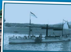
CLERMONT - 1807 First Commercially Successful Steamboat