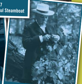
Governor Samuel Pennypacker established game preserves in Pennsylvania in 1905.