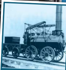
The Stourbridge Lion is the first locomotive ever operated in the U.S. in 1829.

In October, 1940, the first cars rolled onto Pennsylvania's new and innovative turnpike.