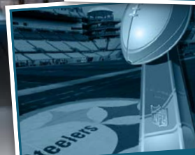
The Pittsburgh Steelers were the first professional football team to win six Super Bowls.